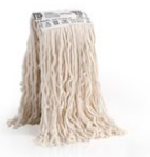
Mop wide central band