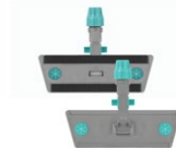
Velook frame with Block System